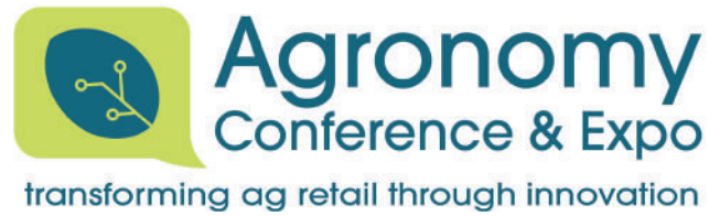
Exhibit & Sponsor Contract

Please confirm that the following information is correct, as it will be used to contact you regarding operational aspects of the exhibit. Please write the company name as you would like it listed in event materials.